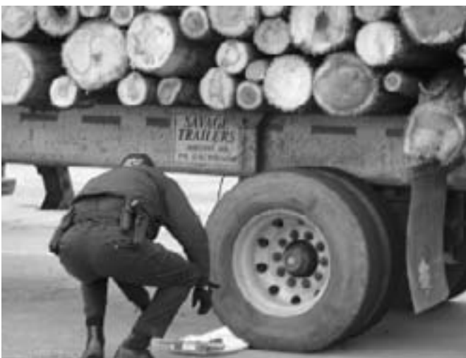
Lt. Ron Silcox checks on an individual axle scale.

According to Halvorsen's ruling, effective immediately, the permits office will accept applications for the higher weight permit for six-axle combinations to include a four-axle straight truck/two-axle pup trailer or a three-axle truck-tractor/three-axle semi-trailer. The permits office will not allow the weight permit on a four-axle truck-tractor/two-axle semi-trailer. Halvorsen says, "We find the