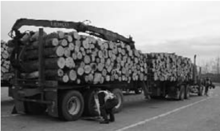
Weighing the different trucks.

If you have questions on permits, you may contact the permits office at www.dot.state.mn.us/motorcarrier/oversize/Applications/index.html