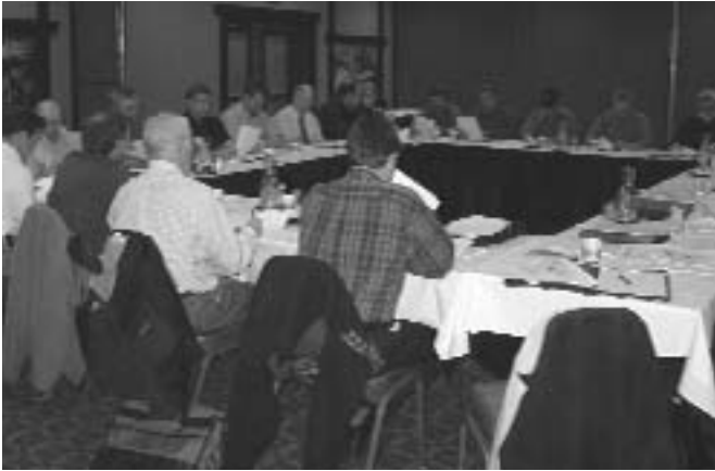
Representatives from MnDOT and St. Louis County meet with the TPA Transportation Committee.