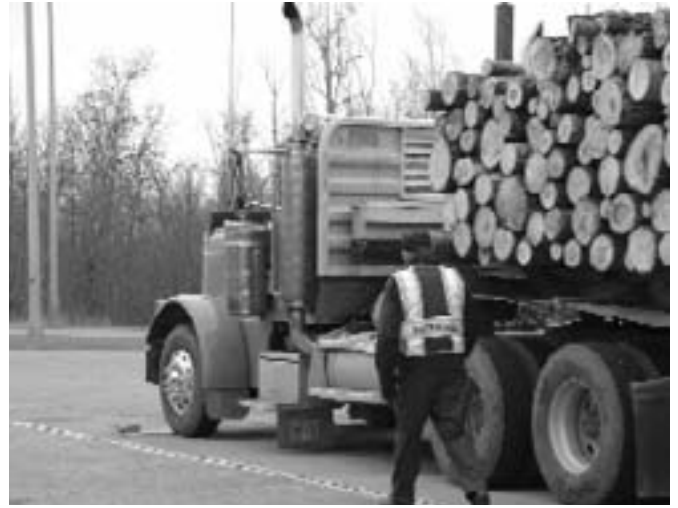
A MSP commercial vehicle inspector walks around the pup-trailer combination.