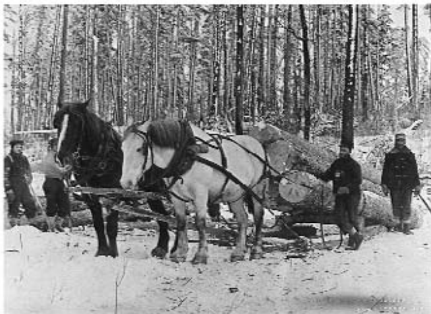
Skidding with drag north of Two Harbors, unloading near Dawson, both 1910.

To cope with the added work of the camp clerk and to explain the working of the labor distribution system, most of the