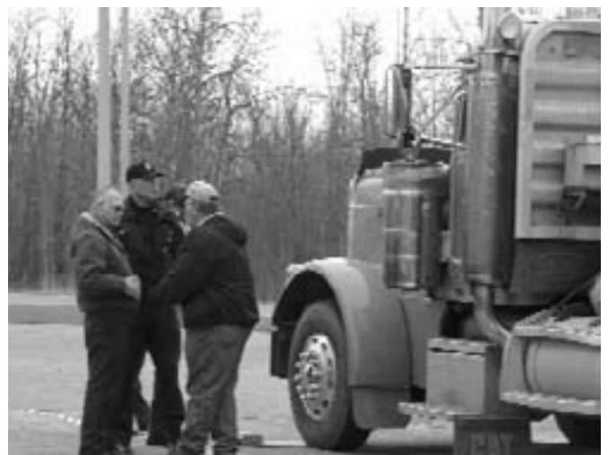
Jerry DeMenge discusses weights with Lt. Silcox.