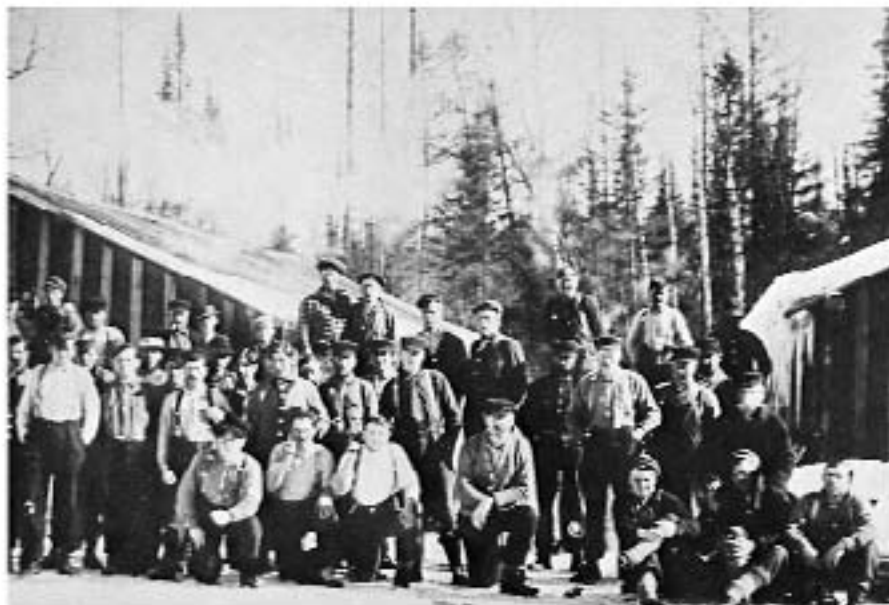
Above: A group of "backs" near Northome, 1905. Below: A small jobber camp near Deer River, 1910. Note the log construction; building with doors open is blacksmith shop.