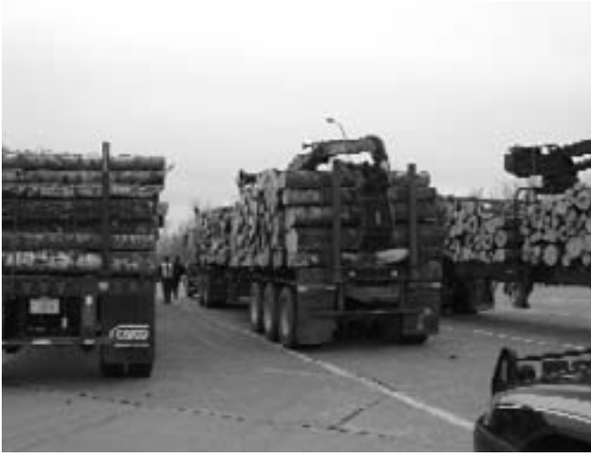
Trucks line up to be weighed for the demonstration at the Saginaw scale.