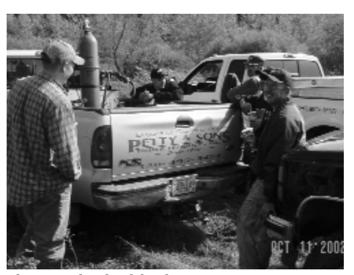
The crews take a lunch break.