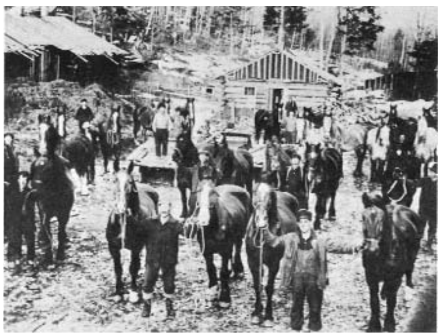
Men in the woods were always proud of horses' performance.

About the only time you would see more than four horses pulling tagather would be on snowplawing—and I've seen at many as 26 horses pulling a snow plow. And in the old logging days, that meant 20 horsespower!