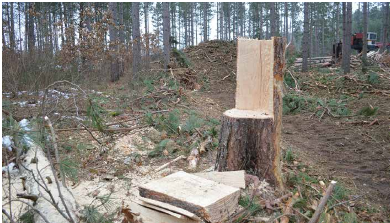
This chair sawed into a stump was spotted on a recent timber harvest near Willow River, created by an enterprising logger who was thinking ahead to when he might have a moment to relax.

existing equipment, generally with pre-owned equipment.