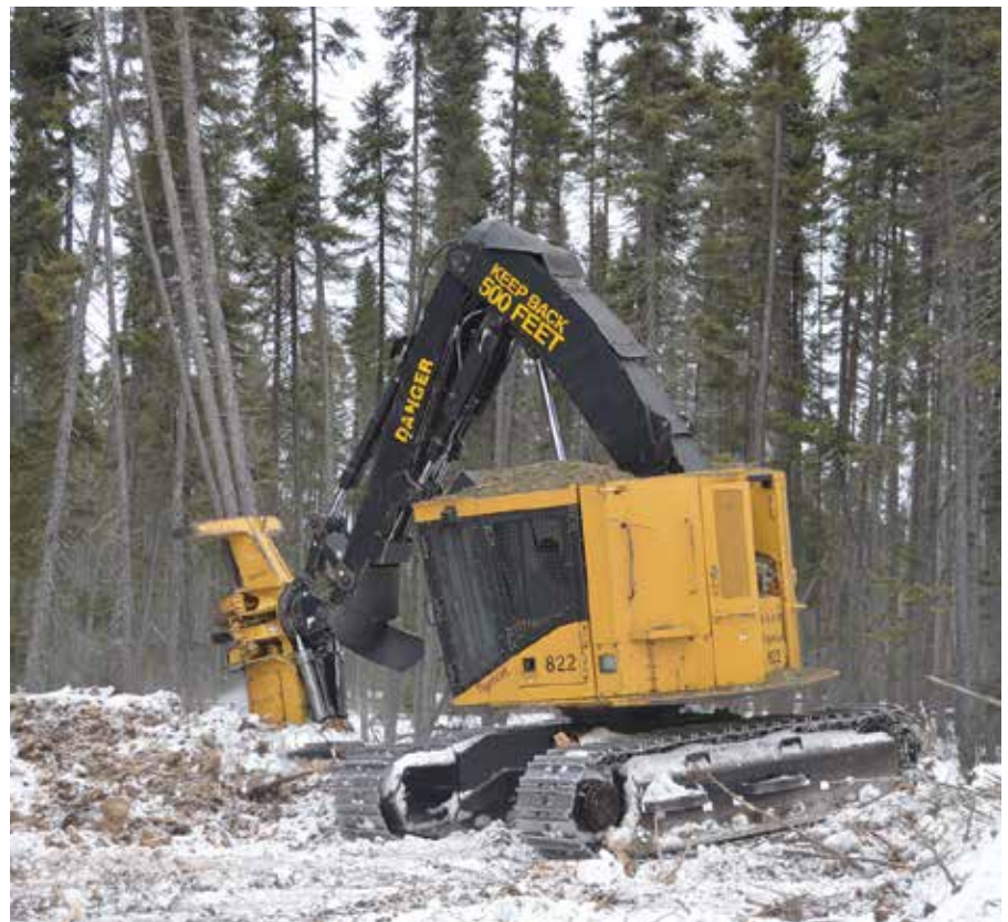
Dwight Swang harvests black spruce with a Tigercat 822 feller buncher.

“and when I found out I had to take biology, I never went back.”