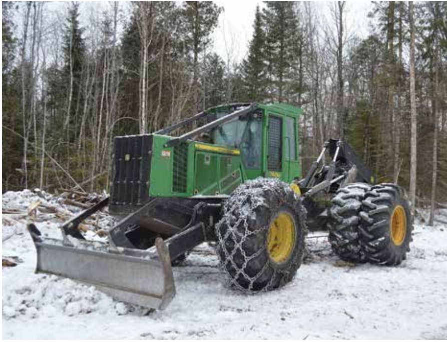
Pelland Logging utilizes dual tires on the back of this John Deere 748H skidder in order to be lighter on the ground, even in winter.