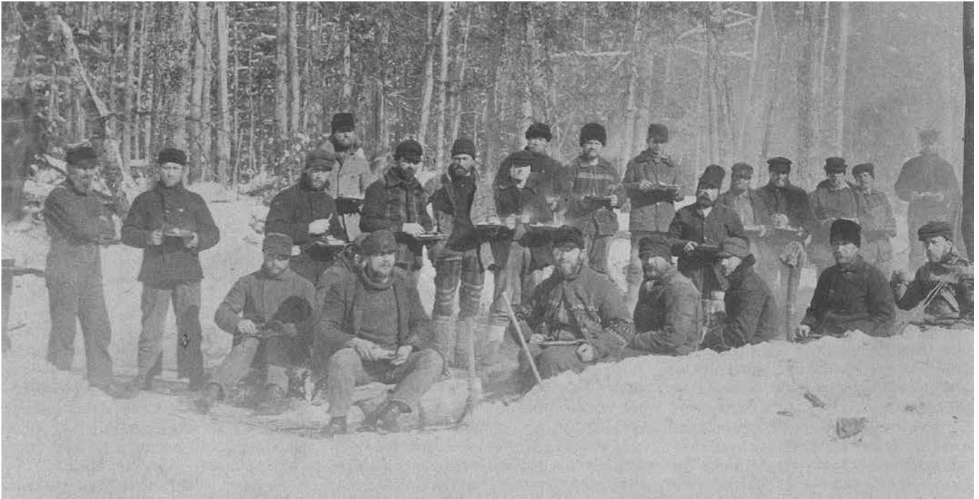
A cookee brought food to the woods in a lunch sleigh called a swing-dingle – built with runners close up in front to avoid brush and gilpokes. The swing-dingle had shelves and partitions to hold food containers and gear and was lined with blankets to keep food hot. Fires were ready, logs were laid out for seating and the crew and lunch arrived at the spot at the same time. Horses were watered, if possible, and blanketed while they were fed oats and hay.