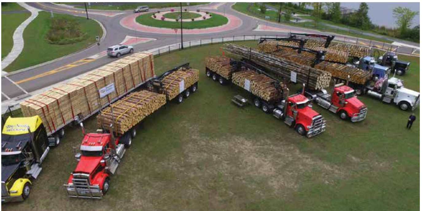
A bird's eye view of Best Load Entries at the North Star Expo. The event returns to the Itasca County Fairgrounds in Grand Rapids in September.