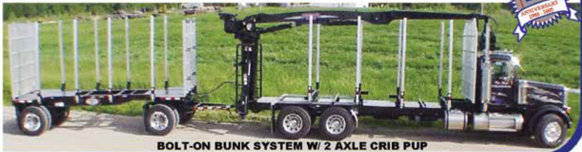
BOLT-ON BUNK SYSTEM W/ 2 AXLE CRIB PUP

Designed & Custom Built to meet your needs.