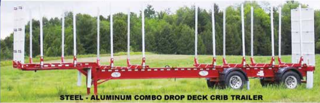
STEEL - ALUMINUM COMBO DROP DECK CRIB TRAILER

8450 County R Suring WI 54174 www.greatlakesmfg.com For Pricing Call Toll Free: 1-877-248-5677