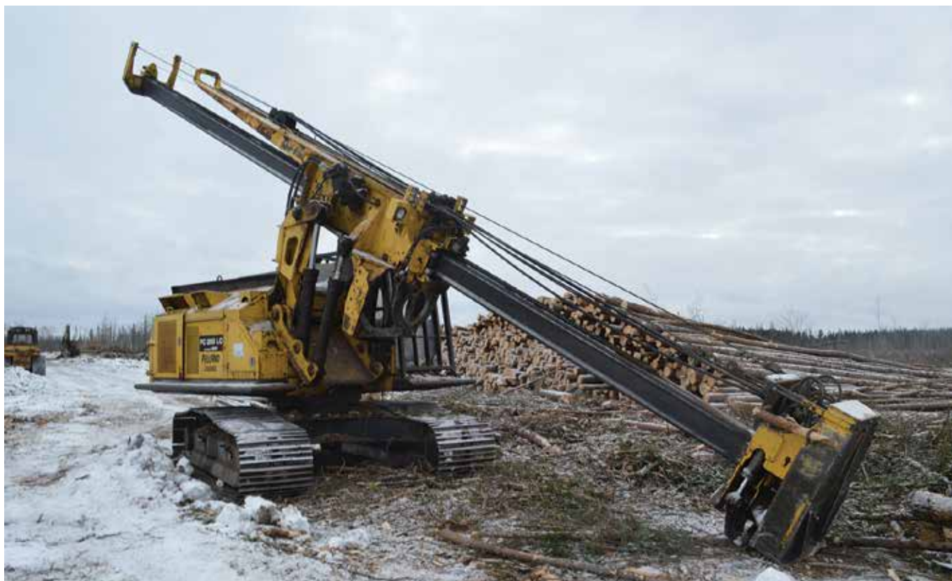
Pelland Logging's stroke delimeter is a Komatsu PC 200 LC with Propac.