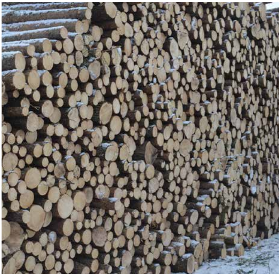
Black spruce pulp from Pelland's harvest site waits to be loaded onto trucks and hauled to PCA's mill in International Falls.

"I don't ever want to retire," Mike says. "We're planning on a smooth transition."