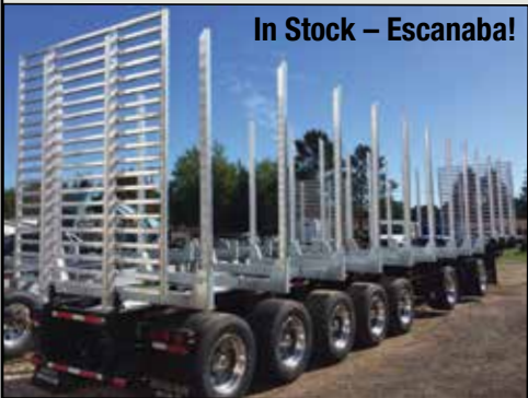
In Stock – Escanaba!

HIGH STRENGTH · LIGHTWEIGHT BUILT TO LAST