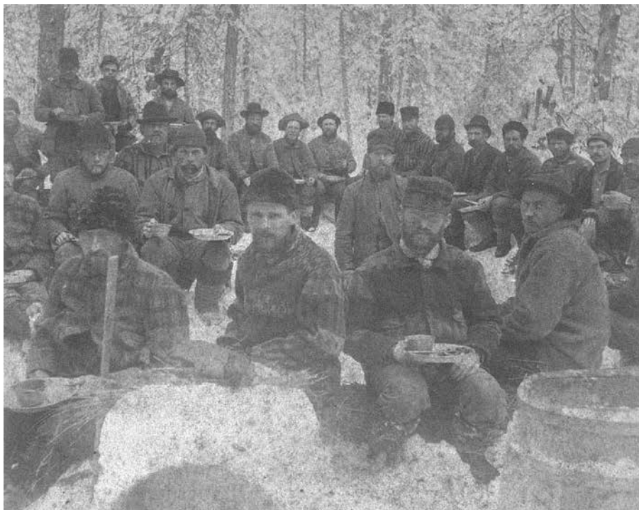
Dinnering out: Lunch time in the woods began at 11:30, usually lasted a half hour.

After the cedar and tie camps came into being and the cutting was done by “piece makers,” they started to carry their lunches to the woods individually. In some smaller camps, no noon meal was served in camp at all. However, in the old logging days, three warm meals a day were in order and “dinnering out” was the exception, not the rule. When they did have a dinner out, the meal was kept just as near the type of meal served in the camp as possible. Lumberjacks just had to have good food.