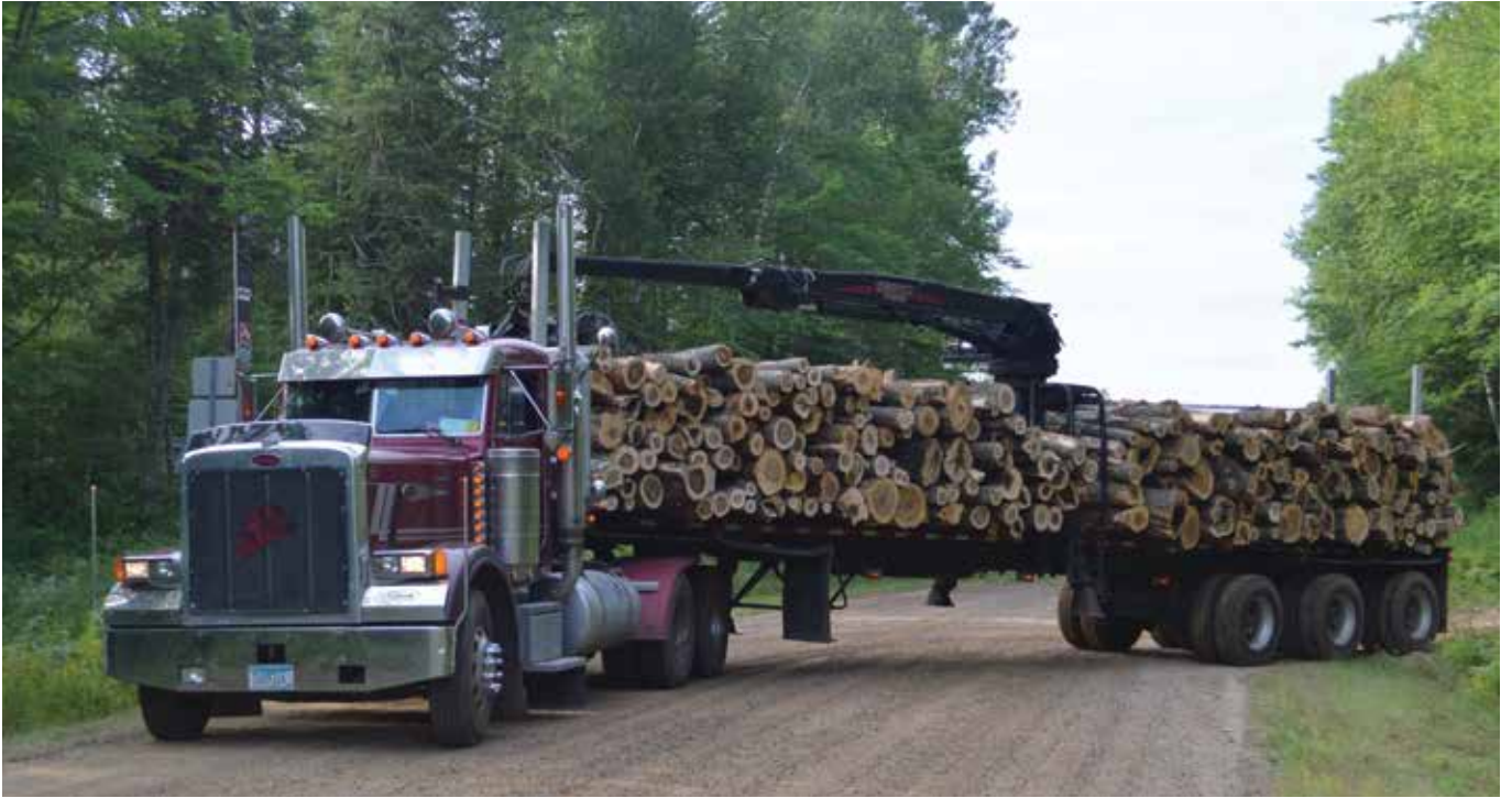
Greg Anwiler of Jobe Trucking leaves the Filipiak harvest site just southeast of Warba with a load of maple and heads for the Sappi mill in Cloquet.