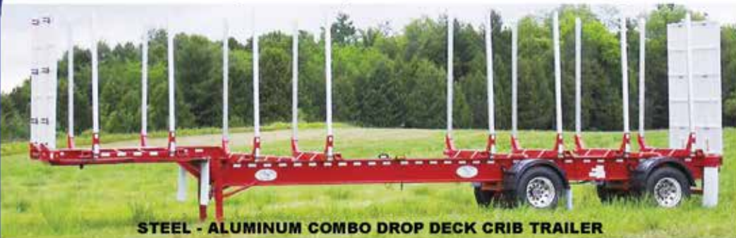
STEEL - ALUMINUM COMBO DROP DECK CRIB TRAILER

8450 County R Suring WI 54174 www.greatlakesmfg.com For Pricing Call Toll Free: 1-877-248-5677