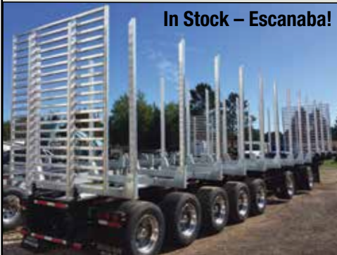
In Stock – Escanaba!

HIGH STRENGTH • LIGHTWEIGHT BUILT TO LAST