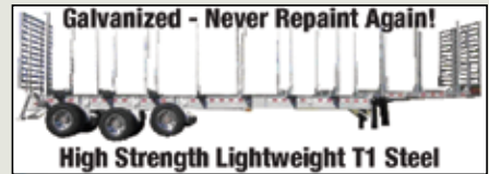
Galvanized - Never Repaint Again!

All Alum. Wheels, Front and Rear Axles Lift, 30K Axles and Suspension, LED Lights, Empty Weight: 13,500# Painted, 13,800# Galvanized.