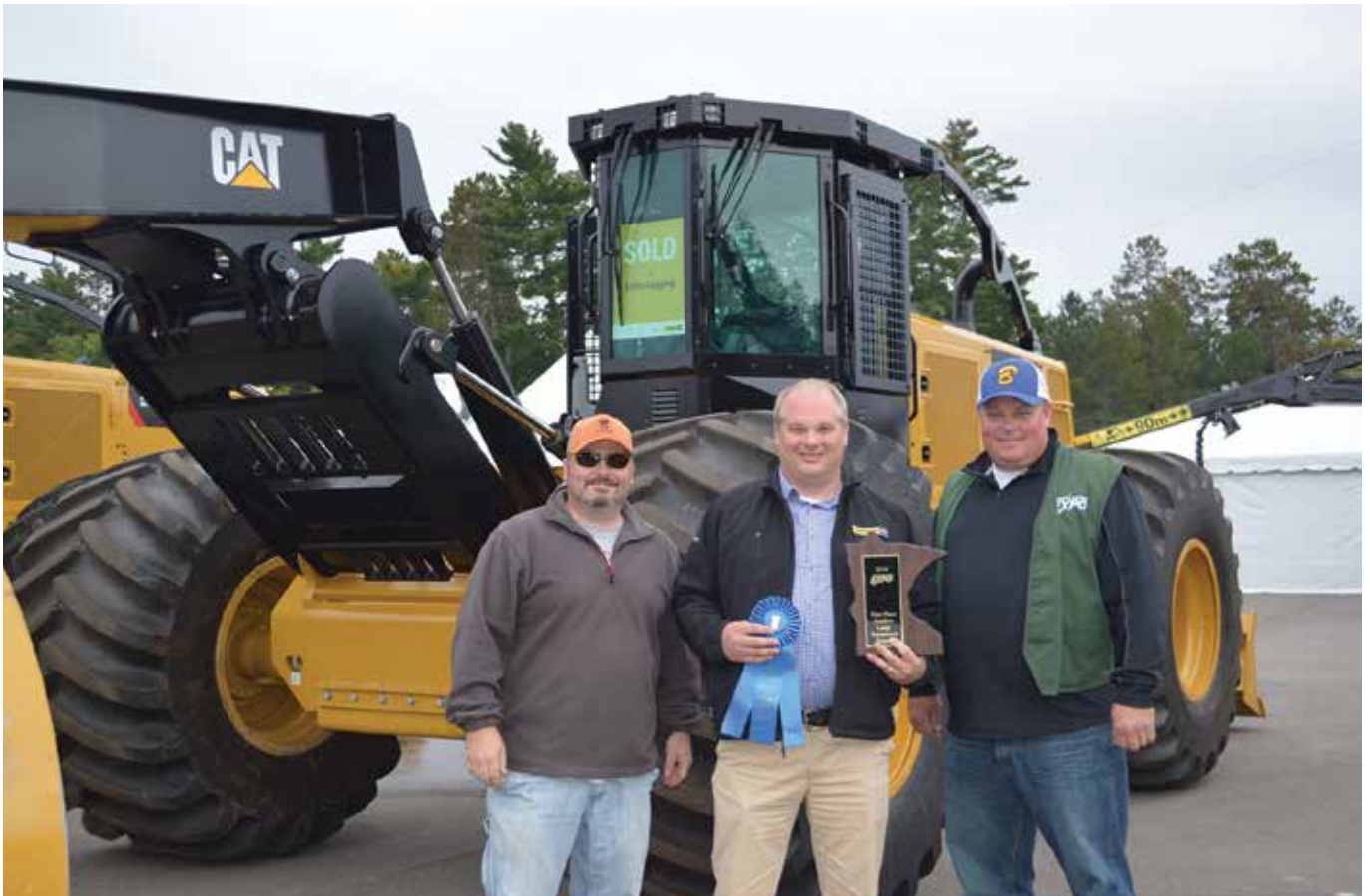
Expo vendors put a lot of time and effort into making sure their displays look their best. Last year, Ziegler Cat received the blue ribbon in the Best Large Equipment division.

The Coloring Contest will take place this year as well. In the last