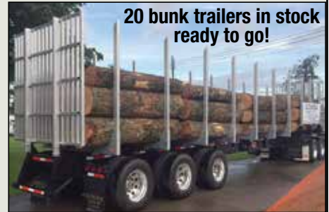
20 bunk trailers in stock ready to go!

Custom built galvanized truck racks for loader trucks. Call for customized quote.