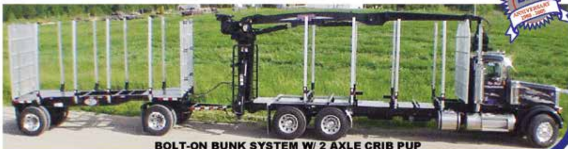
BOLT-ON BUNK SYSTEM W/ 2 AXLE CRIB PUP

Designed & Custom Built to meet your needs.