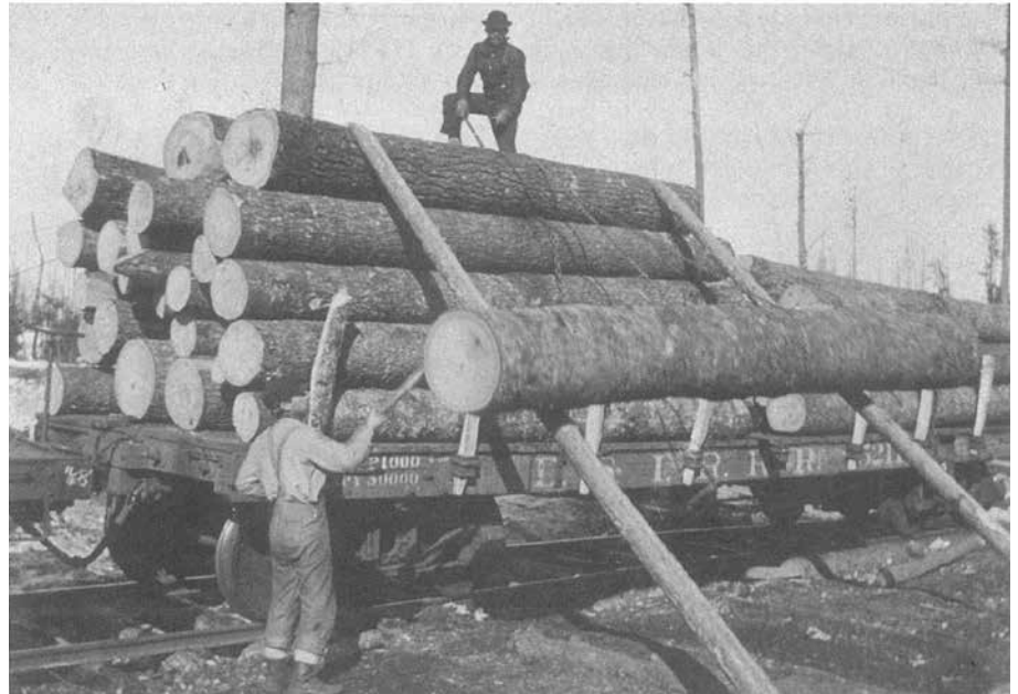
Wood workers performed many dangerous jobs, dressed for cold weather and recorded remarkably good “no-lost-time” records.

Why there were fewer accidents in the old days, I do not know. But it was probably because men were better trained. It was a bad mark against a man if he allowed himself to get hurt. No one wanted to hire a careless man, and no one wanted to work with a careless man. Men took great pride in being able to do a job without having or causing an accidents.