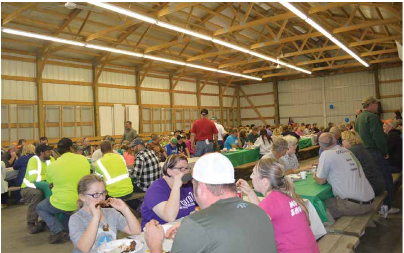
The Expo is known for great food. Last year, Famous Dave's provided the ribs and more for Friday night's barbecue, and the restaurant's tasty fare will be back in 2017!