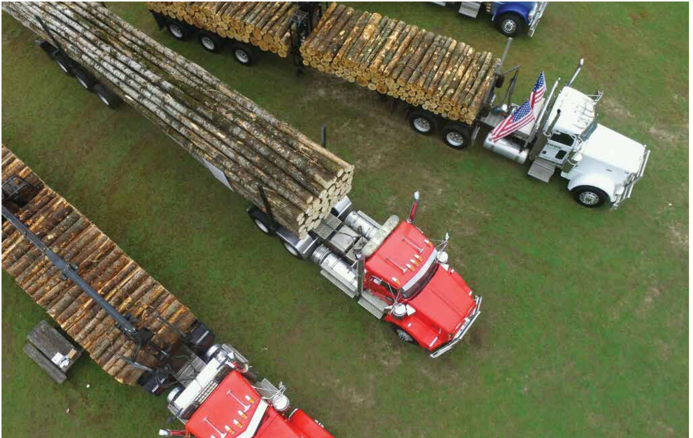
A highlight of every Expo is the Best Load competition, in which loggers and truckers show off the best of the best of Minnesota's wood. This is a bird's eye view of three of last year's outstanding Best Load entries.