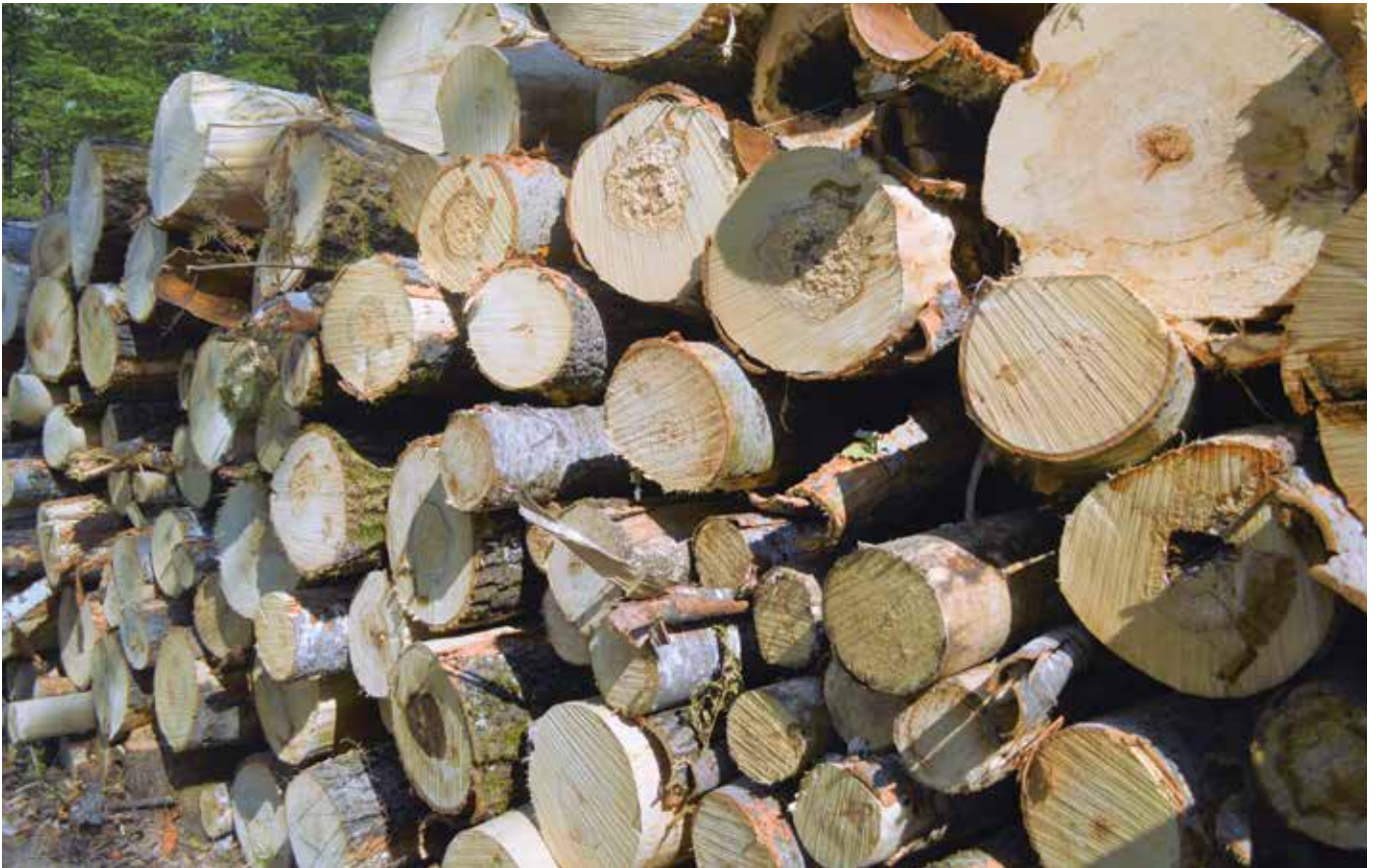
Harvested aspen waits to be hauled to the mill.

wood to cut after that, just as there has been for decades, through four generations of Filipiaiks.