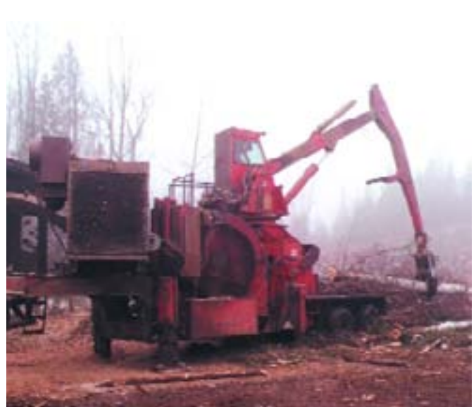
The Morbark chipper makes quick work of the birch.